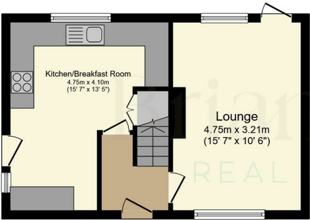
Ground Floor Floor area 34.9 sq.m. (375 sq.ft.)